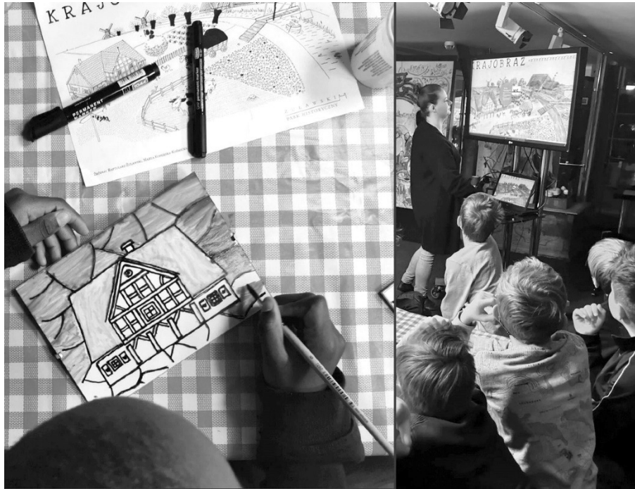
Fig. 2. Use of Raptularz... by external institutions (Żuławy Historical Park).

houses, technical monuments, or elements of interior design). A part of the booklet is devoted to non-material heritage: old crafts, regional cuisine or clothing. The publication was distributed free of charge to local libraries and institutions, and this fairly widespread availability meant that it was used to promote the region in classes by external institutions, including the Żuławy Historical Park, as well as by primary school teachers, who, use it most often in grades 1–3, due to its simplified form (Fig. 2).