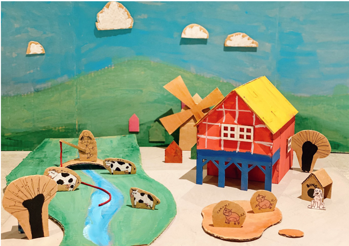
Fig. 5. Additional landscape elements in the work created during online workshops.

Thus, Komorowska's observations that issues related to landscape and regionalism constitute a small part in relation to the whole range of content taught in primary school (Komorowska, 2008) seem to be still valid, but as the analysis of the conducted informal activities showed – there is a possibility to expand in the field of cultural landscape education during other, additional classes.