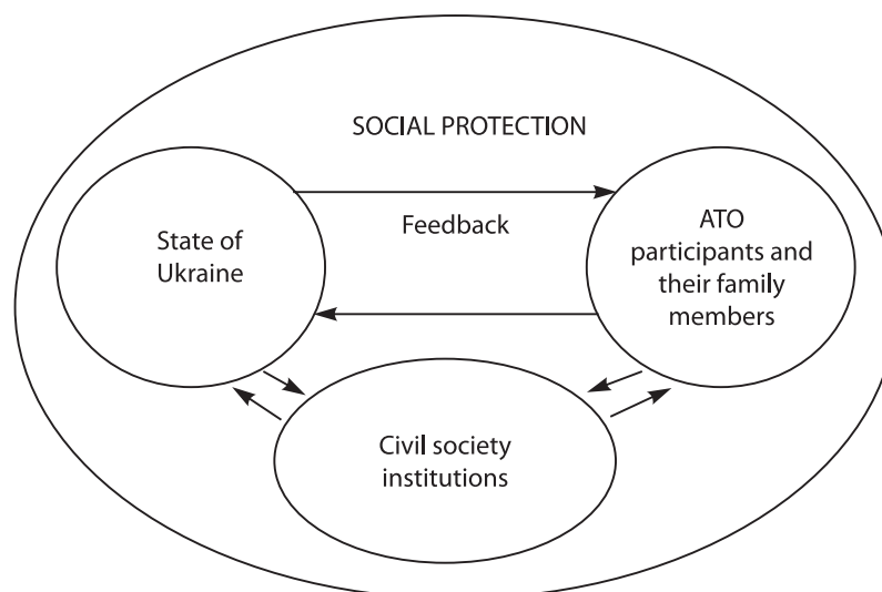
Fig. 2. Efficient interaction scheme

During the study, the concept and contents of the “social protection” and “state governance mechanism” terms have been determined, and the specifics of the comprehensive state governance mechanism