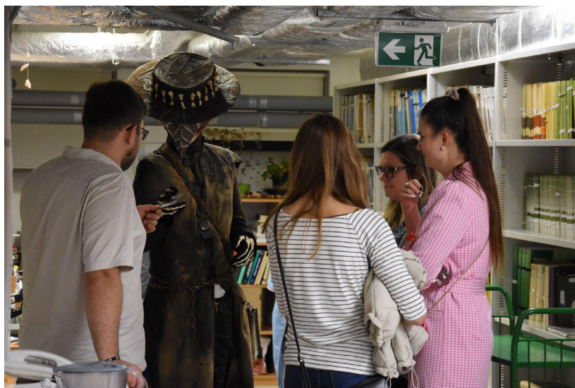
Image 2. AGH doctoral students taking part in the game during the Night of the Libraries on 8 October 2022

From the beginning of the game, the participants also had to play their roles. After being introduced to the storage room, the players had to explain how they got there and why they had a damaged book. As part of the help offered, they were given a 3.5” FDD floppy disk with a clue on the label and information on which computer they could be using it. The first task was to find an external drive with which to read the contents of the floppy disk. From there, a series of clues led to missing pages, tools to fix the book and something to bribe one of the librarians with to help with repairs. The final hints were about getting out of the storage room. The use of the floppy disk as a prop proved particularly appealing to the players, as for the current students it is a technology they no longer have the opportunity to use. In order to read the clues on it, they first had to learn how to use the floppy disk drive.