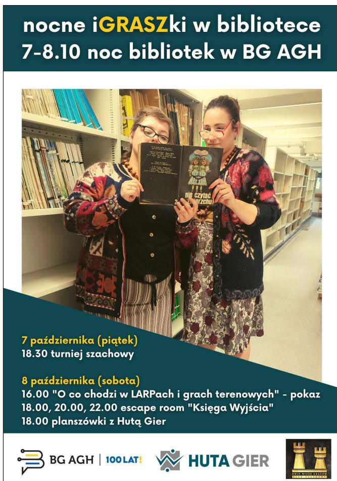
Image 5. Poster promoting the game during the Night of the Libraries