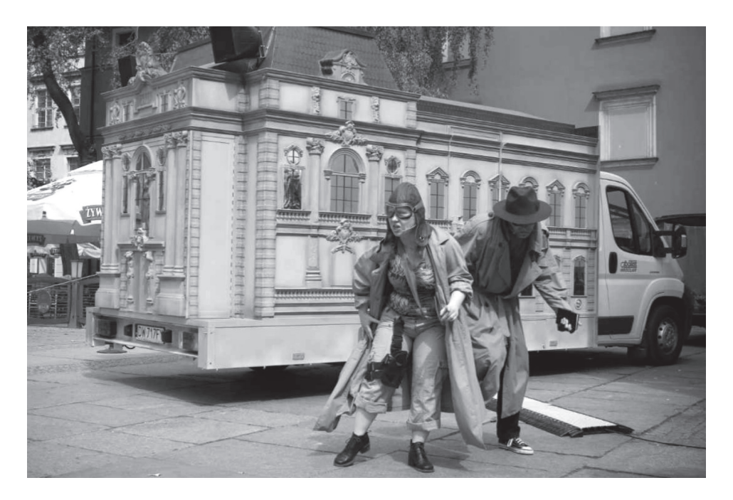
Fig. 3. WPT FairyBus Source: http://wrocnam.bikestats.pl/520356,Dzien-siedemdziesiaty-siodmy.html.