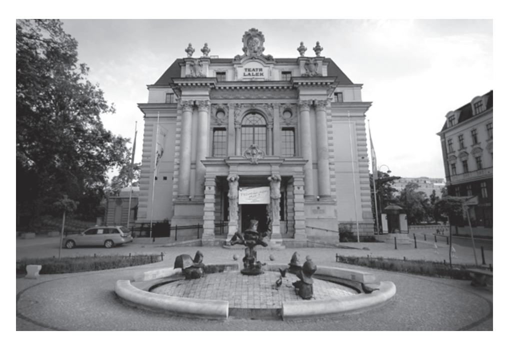
Fig. 2. The house of WPT