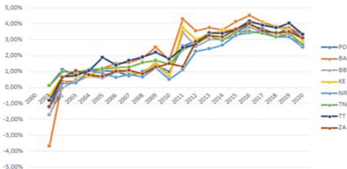
Figure 3. Change in the number of population by regions and years aged 65 plus.

Based on the above facts, it is expected that the growth dynamics of the population over 65 years of age will continue to differ in individual regions. Next, factor II listed in Table no. 6 was researched, i.e. the percentage change in the number of residents over 65 years of age was monitored.