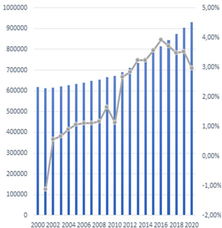
Figure 1. The number and change in the number (in %) of the population over 65 years of age between years 2000 and 2020