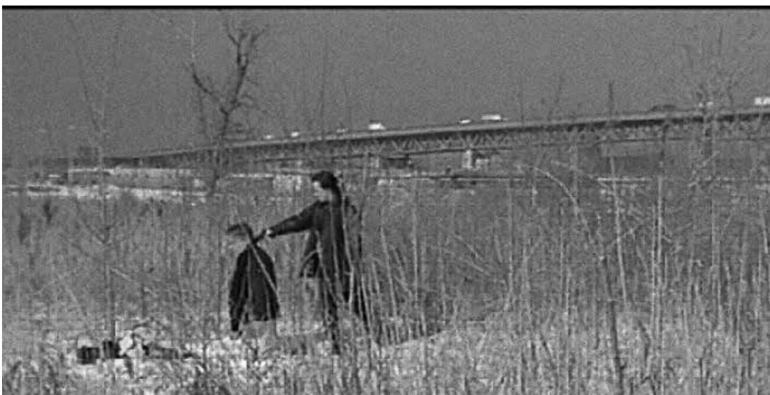
Image 3. The abortive parricide in Little Odessa (James Grey, USA, 1995).