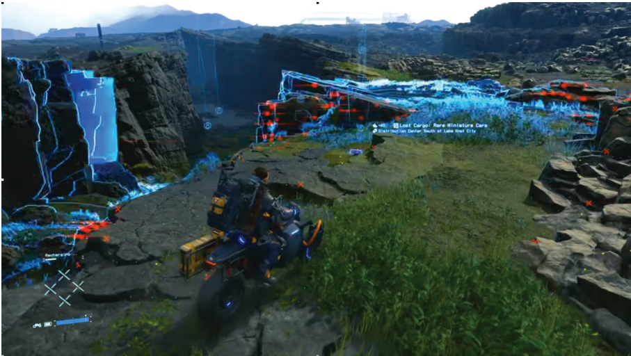
Figure 4 - Apocalyptic and integrated.

sion and for Max Payne's weapons) and the orientation of Payne's body (which is directly tied to the movement of the crosshair) moves in slow motion, granting the player an 'ultra-fast' capacity to aim accurately. Bullet-time acquires its functionality and aesthetics through the contrast between two temporalities – in this case, the time of 'reception' or, better, of interaction is expanded in relation to diegetic time – and this tension becomes painfully clear in the quick contortions of the character's body, which inhabits two temporalities at once in relation to the game world 3 . The video game arguably does respect the 'truism' noted by Erin Maclean in a recent conference paper (Maclean 2021, p. 1), which sees the conventional construction of masculinity as a matter of speed, but, coherently