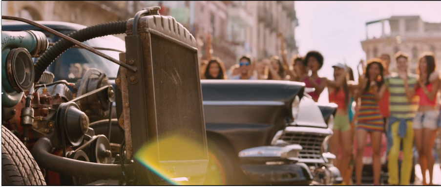
Figure 7 – Alright, we get it.

slipstream, passersby leaping away, enhanced noises, engines steaming unnaturally or becoming red with heat, and other similar effects. In the first race scene in Fast & Furious 8, The Fate of the Furious (USA 2017), the main character Don Toretto (Vin Diesel) finds himself racing the slowest car in Cuba against the fastest. Before they even start their engines, speed and lack of it are already explicitly foregrounded in the dialogue and connoted, heavily, through