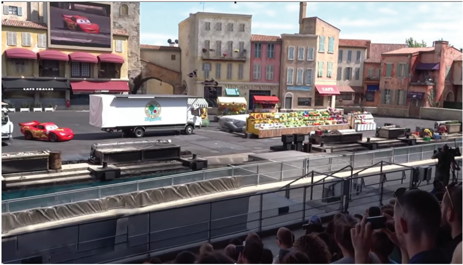
Figure 1 - Out of the screen, onto the stage... and back.

the following stunts. Immediately after, however, the stunts are shown again on the screen, re-experienced in close-up and commented upon. In later segments, stunts appearing on-stage are represented on screen from multiple perspectives (figure 2), explicitly directing the attention of the audience to the use of slow motion and the addition of sound effects, which make them more cinematic. Coherently with Bolter and Grusin's argument, the thrill of immediacy is given through hyper- and re-mediation (Bolter and Grusin 1996, p. 313) and also depends on a considerable, and very much staged, expansion of the temporality of reception.