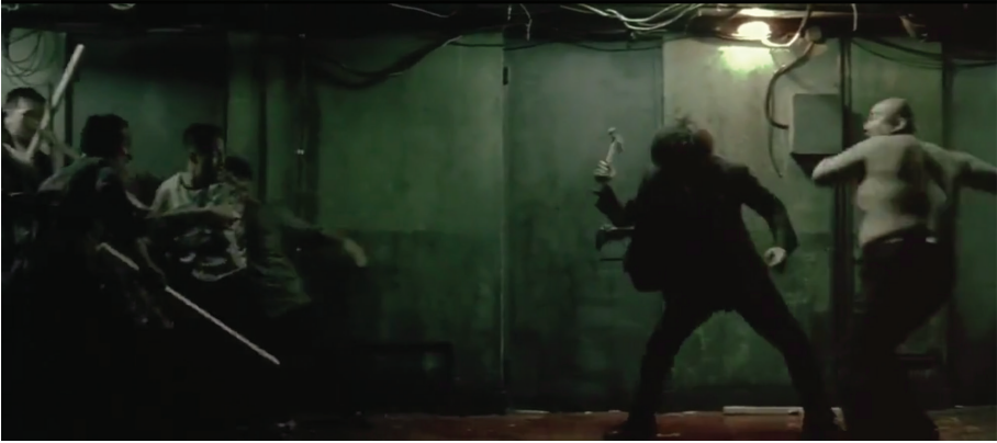
Figure 6 - Slow intensity.

shot' (2008), we can take this sequence from Spike Lee's Old Boy as an example of dramatisation: it is through the quality of the gestures and through the articulation of the shots that the scene acquires its intensity. We could classify Park Chan-wook's scene as 'slow', compared to Spike Lee's, because it uses a single take, slow camera movements, and duration. But does it make sense to do so, especially given that the former is generally considered to be much more energetic and effective than the latter?