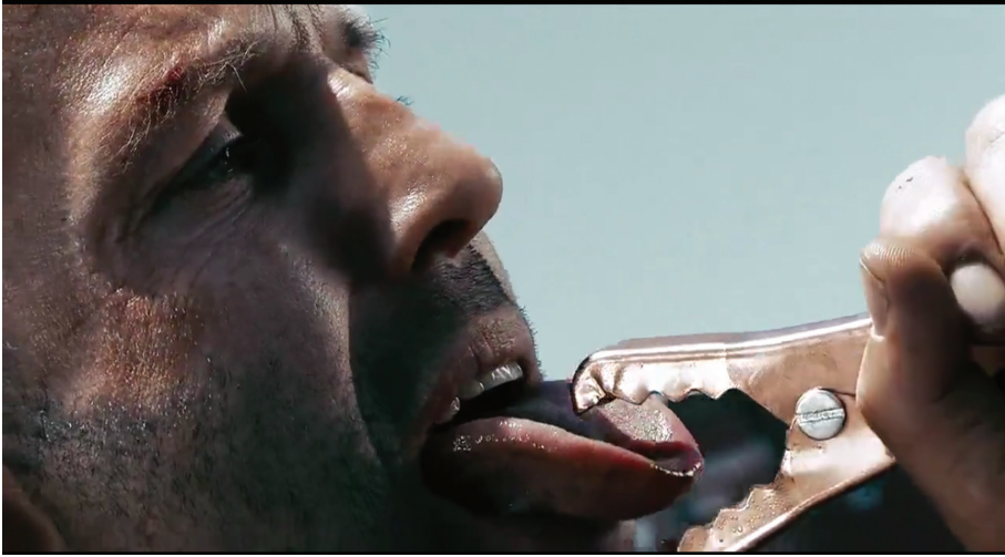
Figure 5 - Human-machine interface.

images of social, political, and religious violence marked as ‘other’ and ‘foreign’ were shown to be part of the animal experiments that result in the outbreak. In a further turn, these are also the elements through which the film re-actualizes old colonial logics and extreme far-right discourses about the origins of violence and the strategies for its containment (Attenwell, pp. 177-179).