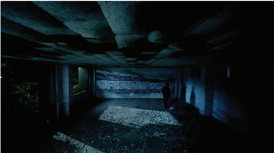
Figure 8 - Framing and duration.

In many respects ‘slow’ films can be perceived to be ‘faster’ and can often present more high-speed complexity than many films that are classified as ‘fast’. One of the very few films I actually felt compelled to stop from time to time because it was ‘going too fast’ was My Winnipeg by Guy Maddin (Canada 2007), which has a very fast montage and spoken a narration that would warrant its inclusion in Thompson’s category of high-speed complexity, but clearly does not meet other, more apparent, criteria which define what fast cinema is supposed to be (like thematic velocity and the connection with irreflexive consumption) and so it is not likely to be perceived as a ‘fast’ film. My Winnipeg is indeed coherent with Archer’s appraisal of ‘fast talking in slow movies,’ as he puts it (Ibid., p. 132), as well as with the general idea of a counterpoint of temporalities that