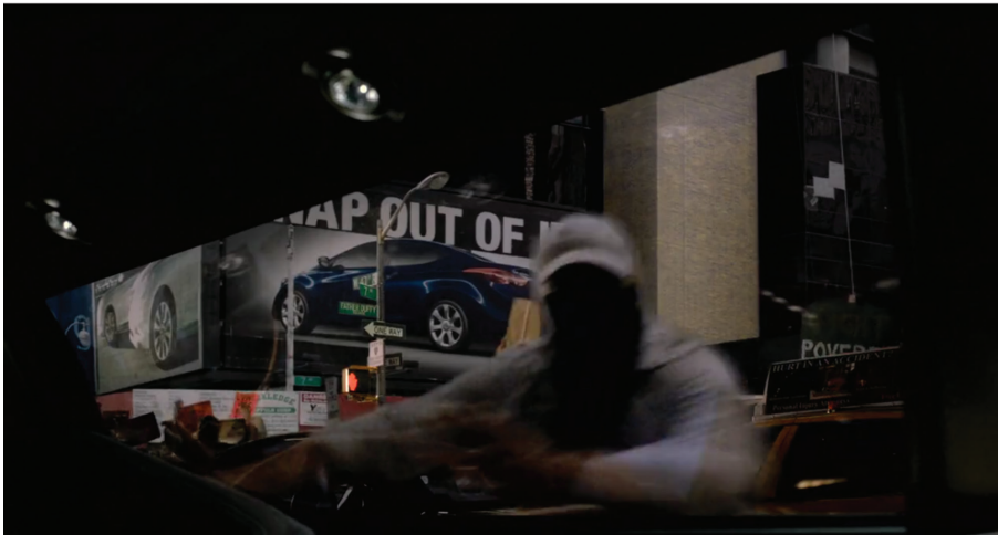
Figure 10 - ‘Something will happen ... to correct the acceleration of time.’

As we have seen, velocity and action in ‘fast’ cinema are not necessarily matched, as thematic elements, by fast-paced narrative flow and, as diegetic elements, by either fast montage or quick camera movements. From the point of view of narration, in particular, action-packed scenes are in many ways moments of stillness: the car chase represents very well the tension, mediated by a specific theme and a particular style of enunciation, between diegetic velocity and the lack of narrative progression. In races, narrative progression is halted, or at least rarefied: from a narrative standpoint, they are long attraction-like build-ups to their decisive conclusion.