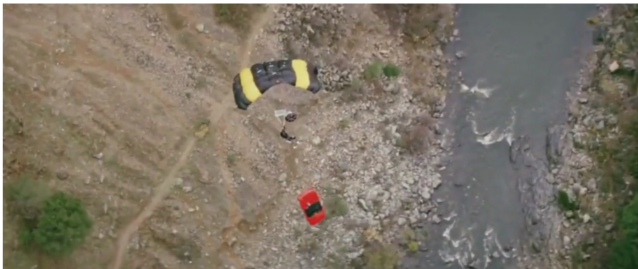
Figure 3 - All of it, again and again...

One distinctive case of the use of slow-motion to signify and sustain fast action lies at the interface between video games and cinema: it is the so-called ‘bullet time’ popularised by films like The Matrix (dir. Wachowski and Wachowski, USA 1999) and video-games like Max Payne (Remedy Entertainment, USA 2001), in which time is slowed down to the point that we can perceive bullets slowly travelling toward their target. In the neo-noir game, the bullet-time