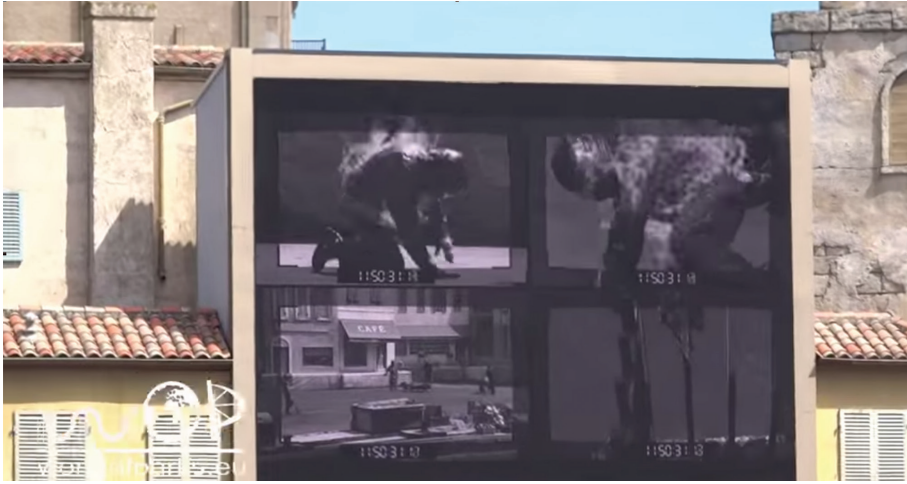
Figure 2 - Spectacular remediation.

One distinctive case of the use of slow-motion to signify and sustain fast action lies at the interface between video games and cinema: it is the so-called ‘bullet time’ popularised by films like The Matrix (dir. Wachowski and Wachowski, USA 1999) and video-games like Max Payne (Remedy Entertainment, USA 2001), in which time is slowed down to the point that we can perceive bullets slowly travelling toward their target. In the neo-noir game, the bullet-time