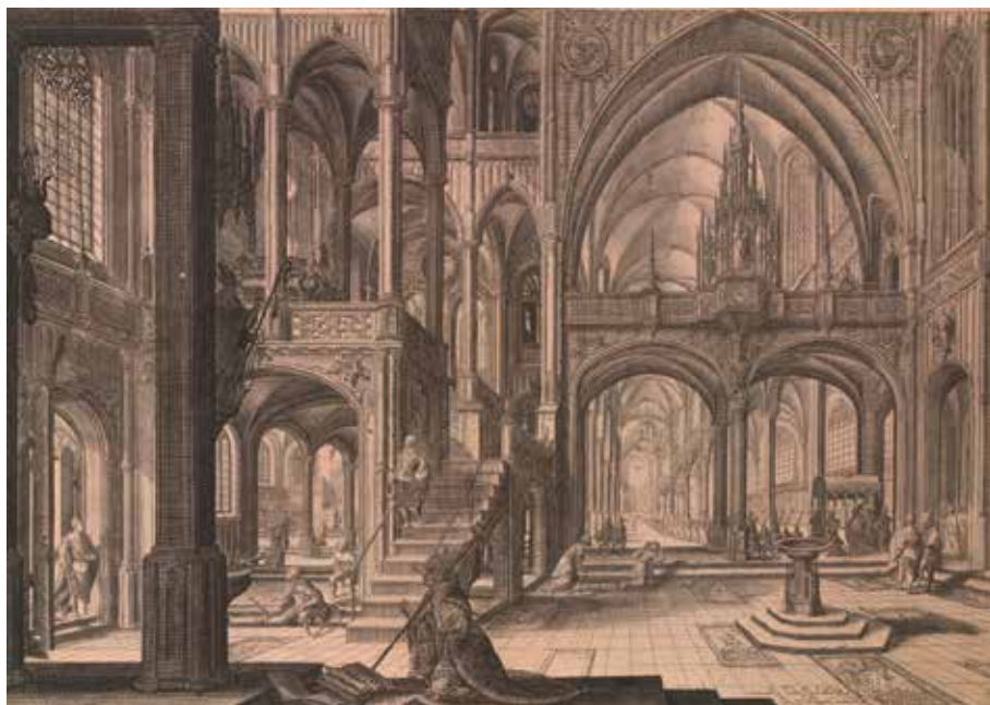
Fig. 3. Jan van Londerseel, Der Papst im Lateran , Albertina Wien, mirrored

Four different and yet similar church interior paintings by H. Aerts, or Hans and Paul Vredeman, respectively, (fig. 3–6) demonstrate their interconnected content and timeframe. These are: Londerseel's inverted engraving with the composition of the unknown church interior by Aerts (fig. 3), the painting Interior of a Gothic Church by Aerts from Brunswick, 38 (fig. 4) the painting Church Interior by Paul Vredeman de Vries from the Rohrau Castle, 39 (fig. 5) and the only datable painting, Interior of a Gothic Church by Hans Vredeman de Vries, dated 1594 and privately owned. 40 (fig. 6)