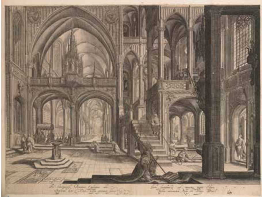
Fig. 1. Jan van Londerseel, Der Papst im Lateran , Albertina Wien

Prints of Londerseel's engraving are part of the graphic collections of the Rijksmuseum in Amsterdam, the Albertina in Vienna, and the Germanisches Nationalmuseum in Nuremberg. With a height of 30.4 cm and a width of 40 cm, the engraving is of conventional size for this type of artwork. The basis for this paper is the Albertina print 4 that matches the sheet owned by the Germanisches Nationalmuseum 5 (fig. 1).