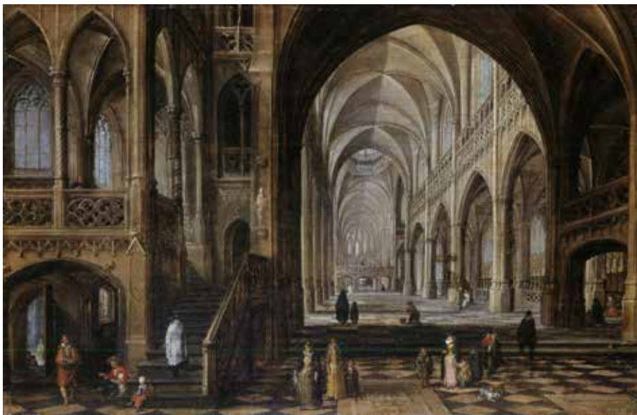
Fig. 5. Paul Vredeman de Vries, Kircheninterieur ; oil on panel, Schloss Rohrau NÖ, Graf Harrachsche Familiensammlung, repr. Fusenig/Vermet Einfluss , 163, Abb. 4