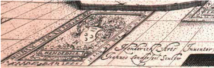
Fig. 2a. Aerts' grave plate and inventor-, sculptor-inscription, detail of Jan van Londerseel, Der Papst im Lateran , Albertina Wien

In the history of the printing plate it has repeatedly been assumed to have been the other way around, i.e., an initially existing publisher's imprint was removed before circulation. However, the difference in writing between the inscriptions of 'Inventor' and 'Sculptor' on the one hand and the publisher's imprint 'C. I. Visscher excudit' on the other proves that this is not the case (fig. 2 below).