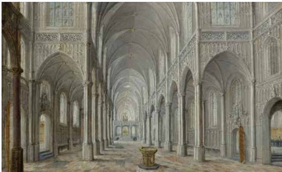
Fig 6. Hans Vredeman de Vries, A gothic church interior , 1594, oil on panel, private ownership, repr. https://www.invaluable.com/auction-lot/vredeman-de-vries-hans-3018-c-1964444810