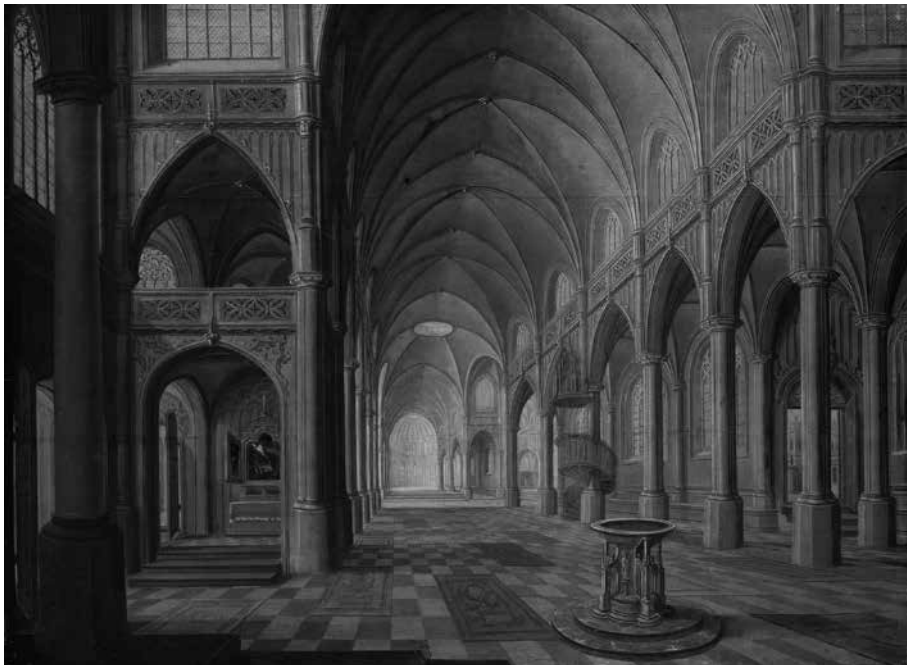
Fig. 4. Hendrick Aerts, Inneres einer gotischen Kirche ; oil on panel, Braunschweig, Herzog Anton Ulrich-Museum