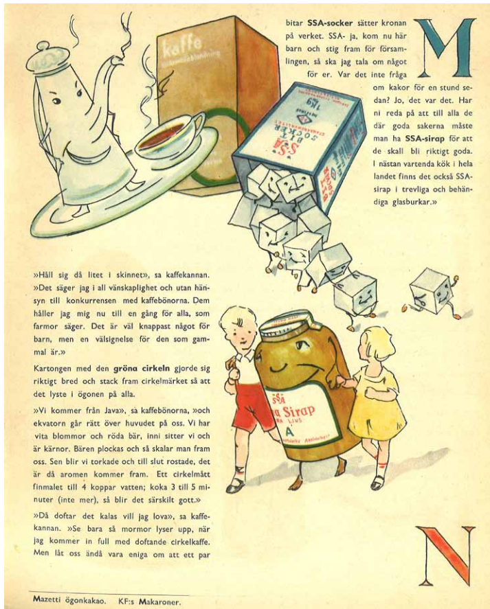
Fig. 4. © Atelier E.O. Per and Lisa's Christmas Citchen (1935)

proposes that “once the toy becomes animated, it initiates another world, the world of the daydream. The beginning of narrative time here is not an extension of the time of everyday life; it is the beginning of an entirely new temporal world, a fantasy world parallel to (and hence never intersecting) the world of everyday reality” (Stewart 1993: 57).