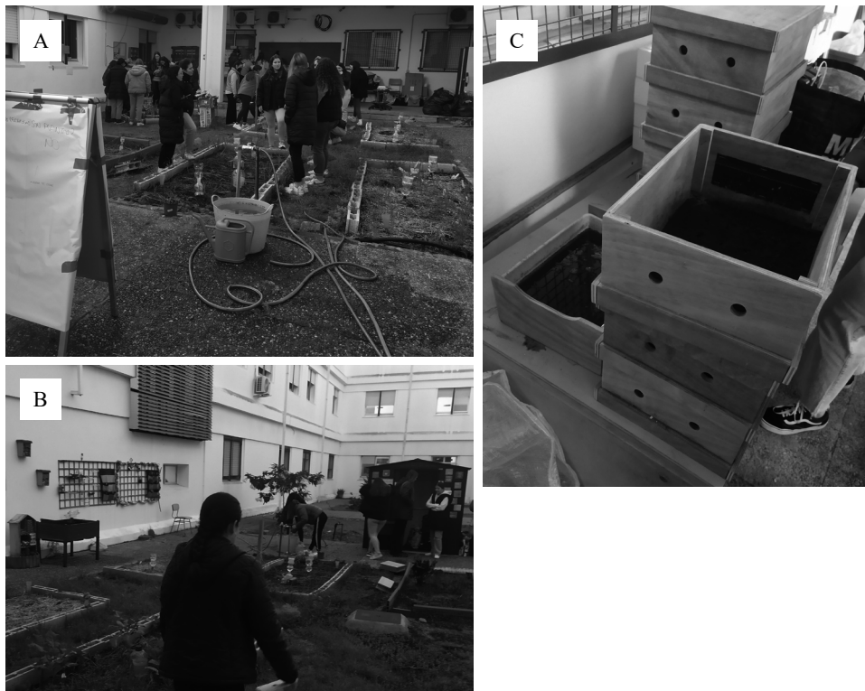
Figure 1. Layout of the University Ecological Garden of the Faculty of Educational Sciences Universidad de Cádiz: A) garden plots; B) vertical garden, grow table and insect hotels; C) worm composting bins