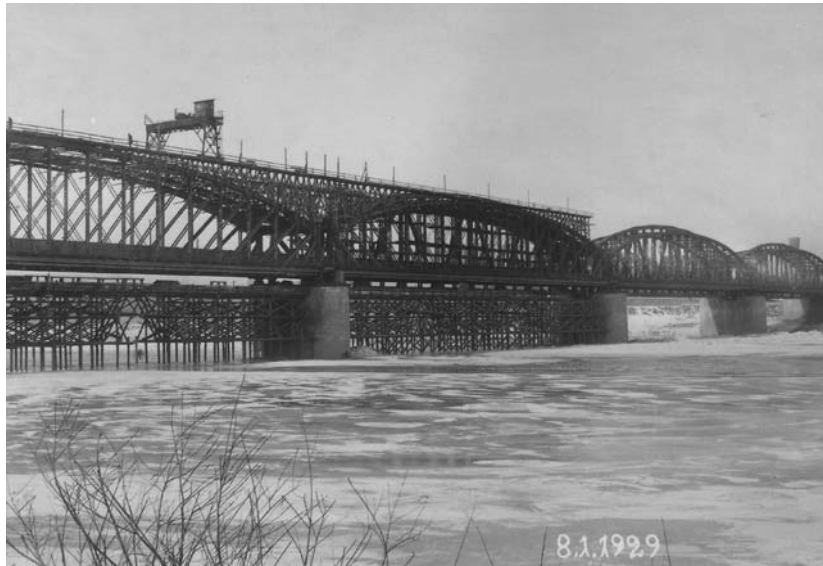
Fig. 4. Toruń railway bridge strengthening, 1929