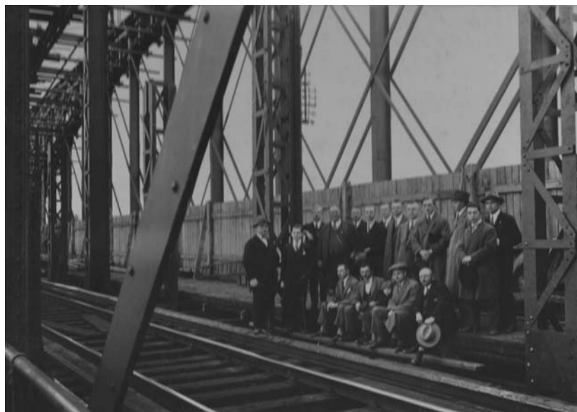
Fig. 5. Bridge rail track terminated, 1929