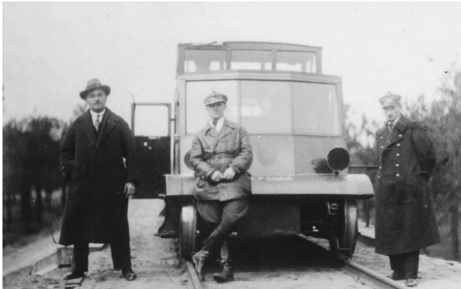
Fig. 6. On control of the Śląsk–Gdynia railway line, 1932

during the interwar period at the Technische Hochschule der Freien Stadt Danzig (Free City of Danzig University of Technology) 2 – became my study adviser when I was preparing my master of engineering thesis at GUT in 1954; just afterwards I became – at the quoted Chair – his assistant and senior assistant. Could I ever imagine such movements in my life?