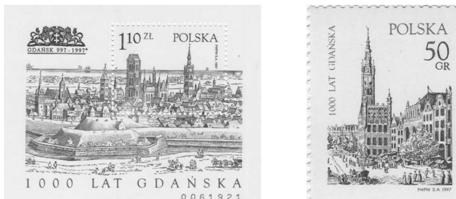
Fig. 8. Postal commemoration of the Gdańsk Millennium

in the cultural and economic life of Poland and Europe; in fact at that time in this country, the events in Gdańsk, influenced the course of the world history.