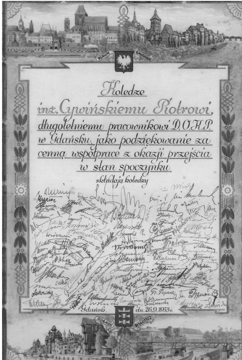
Fig. 3. Echo of fairwell, 1953