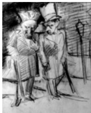
Film still from The Cabinet of Dr. Caligari , directed by Robert Wiene, 1920. Bruno Schulz, Joseph and Dr. Gotard , ca. 1933.