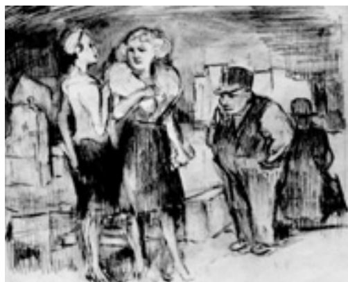
Film still from Joyless Street , directed by Georg Wilhelm Pabst, 1925. Bruno Schulz, Two women and two men in the street , before 1932.