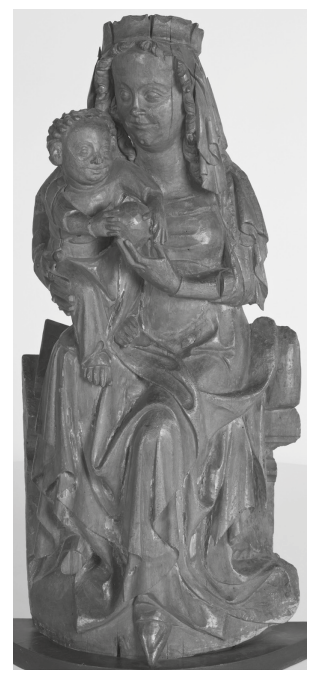
Fig. 3. Mary with the Child, Jeziernik, ca. 1375, now in National Museum in Gdańsk; photo: National Museum in Gdańsk