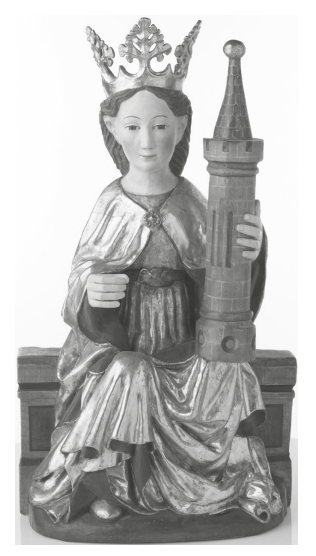
Fig. 11. St Barbara, Stara Kościelnica, ca. 1420, now in National Museum in Gdańsk

if they originally came from different workshops. Based on formal features, Jakubek-Raczkowska mentioned the possibility of its provenience from the same workshop as a few other artworks from Gdańsk or from workshop from north-east Prussia, but originating in Gdańsk. ^{35} These include the figure of St Barbara from Stara Kościelnica, dated c.1420 (Fig. 11), the now lost figure of St Nicolas from the Altarpiece of St Nicolas from St Mary's Church in Gdańsk, dated c.1425, the relief with a scene of the Dormition of the Virgin also from St Mary's Church in Gdańsk, dated after 1400,^{36} and a few other sculptures from different churches from the Warmia and Sambia regions. ^{37} In the Prussian context, not only are the stylistic and formal details of the sculpture of St Anne interesting; the altarpiece is also comparable to retables from Gdańsk in its overall form. Unfortunately, altarpiece that in construction is most like this from Väte is now lost, but is well known from a pre-war photographs. ^{38}