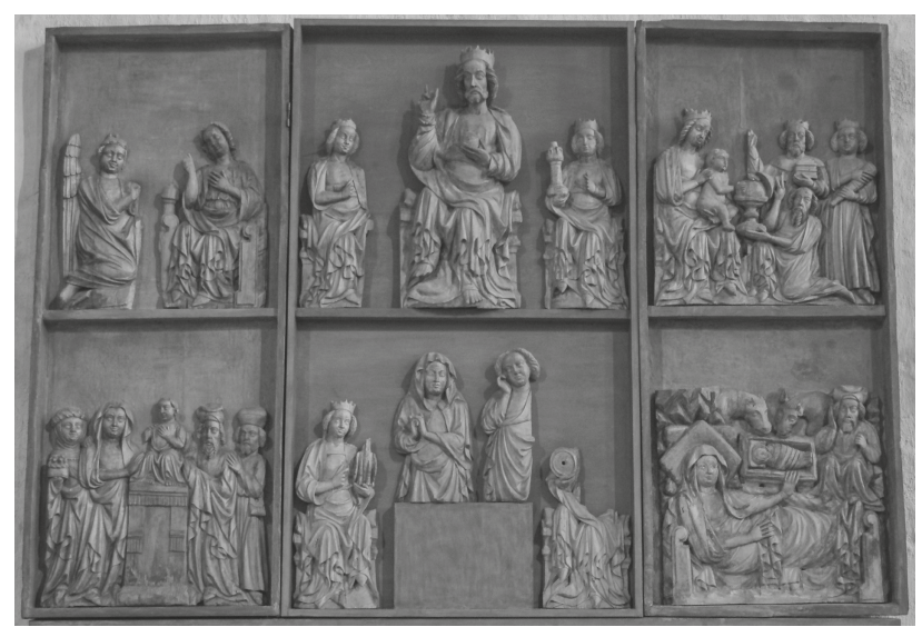
Fig. 4. Reliefs from the altarpiece, Mynämäki, ca. 1410–1420, photo: Weronika Grochowska