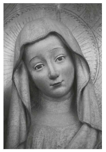
Fig. 10. St\,Hedwig from St Hedwig's Altarpiece, Gdańsk, ca. 1430–1440; photo: Weronika Grochowska