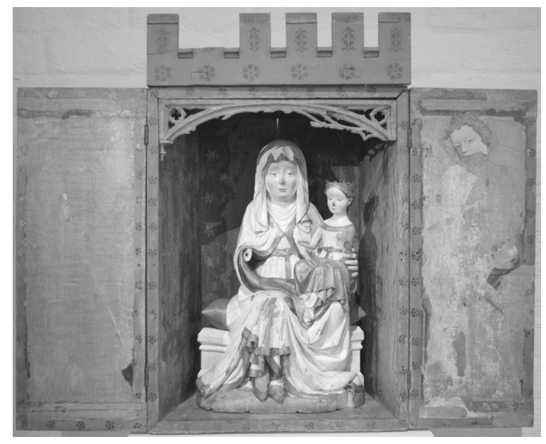
Fig. 9. Altarpiece with St\ Anne , Väte, ca. 1425, now in Historiska Museet in Stockholm; photo: Weronika Grochowska