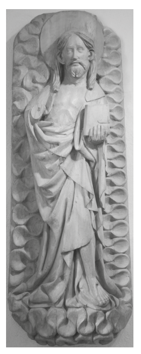
Fig. 12. Resurrected Christ, Viby, ca. 1440

There are no information about original construction of that altarpiece. Current one is from 1664. Figures of apostles from previous altarpiece were repainted and mounted into new artwork, created