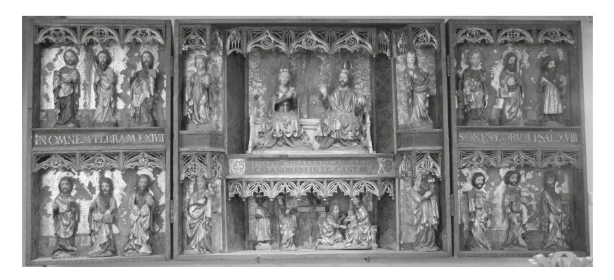
Fig. 7. Altarpiece, Rauma, ca. 1430–1450; photo: Weronika Grochowska

niche right below the Coronation group. Additional scenes in this part of the corpus also appeared in some Prussian altarpieces, but there are no sources that could support the assumption that this was common. The proportions of the Rauma altarpiece are also similar to Prussian examples. Many resemblances could be noticed with the altarpiece from Pörschken, now in the Castle Museum in Malbork, although, in this case, Mary with the Child occupies the central niche instead of the Coronation group, and there is no second scene below.