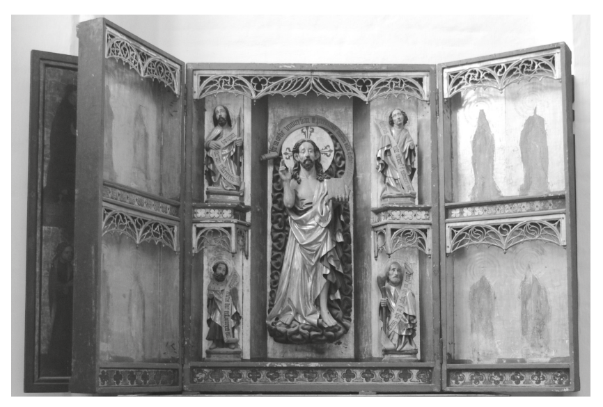
Fig. 13. The Dispersion of the Apostles' Altarpiece, Gdańsk, ca. 1440

There are many other artworks in Sweden and Finland that are considered by art historians as possible imports from the territory of the State of the Teutonic Order in Prussia. Sculptures from Viby are not the only examples of direct connections between Gdańsk artwork and that in Sweden. For example, another is a crucifix from Färetuna, which was linked with the Crucifix from St Catherine's Church in Gdańsk that is now held in the National Museum in Gdańsk. Worth to notice is that Karl Knutson Bonde could be also connected with this particular transfer – one of his daughters had wedding in Färentuna Church in 1440. Unfortunatelly, for other potential transfers there are no written sources which could outline the background of similar activity.