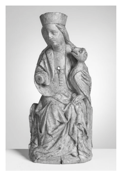
Fig. 5. St\ Margarethe , Marttila, ca. 1420–1440, now in Kansallismuseo in Helsinki