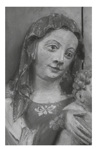
Fig. 2. Mary, Tyrvää, ca. 1400–1420, now in Kansallismuseo in Helsinki; photo: Weronika Grochowska