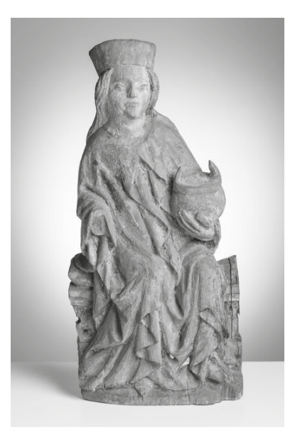
Fig. 6. St Dorothea, Marttila, ca. 1420–1440, now in Kansallismuseo in Helsinki

now in the Finnish National Museum in Helsinki, while the other five sculptures are still in Marttila. Only two figures of male saints are extant— St John the Evangelist and St Bishop—which suggest that on the wings perhaps there were representations of the Collegium Credo, but this cursory assumption must be examined in more detail. With or without the Collegium Credo, this altarpiece could be a good example of Prussian production in its form and style.