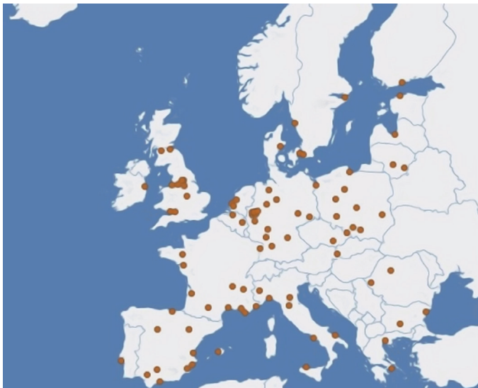
Figure 1. European medium-sized cities in Smart City ranking in 2015

Since 2007, the TUWIEN team has worked on the issue of smart cities. The European Smart City Model has been developed in cooperation with different partners and in the run of distinct projects financed by private or public stakeholders and actors. Basically it provides an integrative approach to profile and benchmark European medium-sized cities. 90 European cities with a population of 0.3-1.0 million were included in the European Smart City ranking of 2015. Figure 1 shows the cities included in the 2015 ranking. There were 20 cities from the new Member States included in the ranking. The greatest number of them, as many as 9, came from Poland (Bydgoszcz, Gdańsk, Katowice, Kraków, Lublin, Łódź, Poznań, Szczecin and Wrocław), there were 2 cities Bulgaria (Plovdiv and Varna), (Cluj-Napoca and Timisoara), Lithuania (Kaunas and Vilnius) and the Czech Republic (Brno and Ostrava) and one city from Latvia (Riga), Estonia (Tallinn), Slovakia (Bratislava). The detailed methodology of the ranking can be found in the final report of the project implemented by the team from the Vienna University of Technology (Centre of Regional Science, 2007).