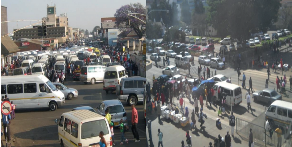
Figure 2. (left) Steet blocked by minibus taxis; (right) Minibus loading and unloading in the middle of the road

growth in minibus taxis as the primary mode of transportation. Without regulation, the taxis have a monopoly of the public transport sector. There is an inequitable allocation of routes, resulting in an overproduction of transport services in one area, excluding other routes. The fares are not set and fluctuate according to economic conditions, weather and “feelings” of the driver. Overcrowding in the minibus taxis is another problem. Because operators need to make as much profit as possible they overload their vehicles, which results in faster degradation of road infrastructure and accidents.