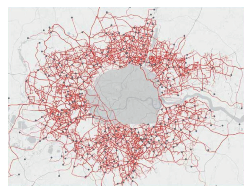
Figure 3. Map of Uber connections in London

When developing the MEVO system, civil servants should not forget about the suburban district (Metropolita area of Gdansk Gdynia Sopot, 2018) where reaching the nearest Rapid Railway (PKM) stop will be crucial. The road infrastructure should be developed on the outskirts of the city, and thus the construction of a metropolitan bypass road will allow the transit to be transferred to this road. During the holiday season this infrastructure will male it possible to relieve the Tri-City bypass road which is heavily jammed with traffic. This will also open up the Tri-City to visitors from cities like Słupsk. The beneficiaries of the new road will include also the adjacent municipalities whose road networks will be linked to this bypass. (General Directorate of Public Roads and Highways, 2018) The tourist economy of the region will also benefit from this solution, as it will enable better and faster movement across the entire Tri-City urban agglomeration, and even the entire Pomorskie Voivodeship.