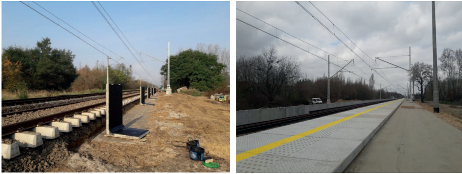
Figure 5, 6. Construction of the Poznań Podolany passenger stop, as at 19 th October 2017 and 31 st March 2019