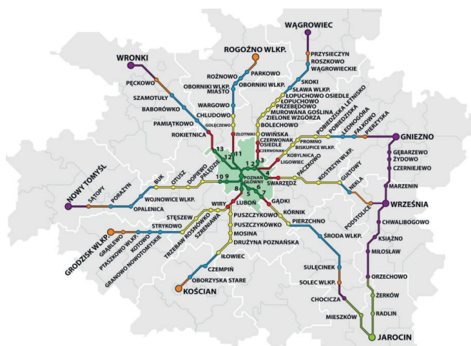
Figure 4. Passenger stations and stops in the agglomeration – passenger traffic