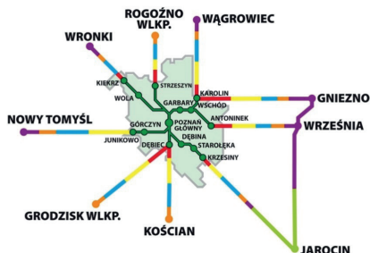
Figure 3. Stations and passenger stops in Poznań – passenger traffic

The railway infrastructure in the city of Poznań and the Poznań agglomeration offers great potential for use in passenger transport, which is one of the elements of the origin of the PKM project. The following figure (Figure 3) shows a current map of stations and passenger stops used in regular passenger traffic. This figure contains stations in the city of Poznań.