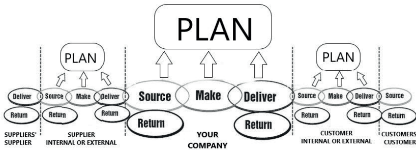
Figure 1. SCOR model

In the literature there is a gap in the knowledge concerning the efficiency of supply chains in the context of designing and developing a proper model of efficiency evaluation. However, the literature connected with a model of performance measurement of a supply chain is extensive. The most frequently examined and implemented model is the one developed by the Supply Chain Council, which is the Supply Chain Operations Reference (SCOR). This model is generally used in identification, measurement, reorganization and improvement of overall supply chain processes (Delipinar, Kocaoglu, 2016; Dissanayake, Cross, 2018). These processes, namely plan, source, make, deliver and return, are presented in Figure 1.